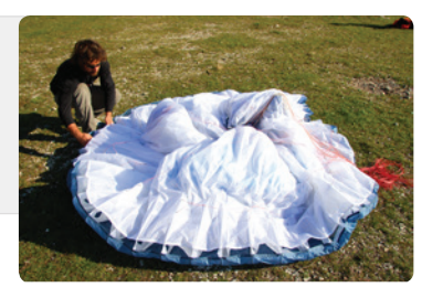
Step 2. Group LE reinforcements with the A tabs aligned, make sure the plastic reinforcements lay side by side.

Step 1 . Lay mushroomed wing on the ground. It is best to start from the mushroomed position as this reduces the dragging of the leading edge across the ground.